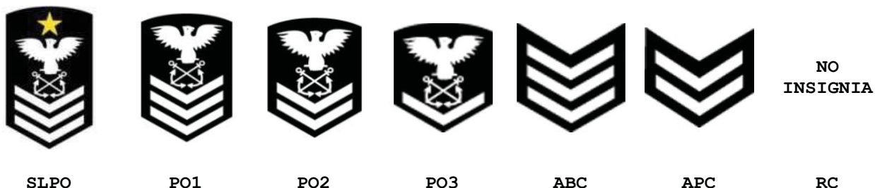
FIGURE 4-2-3 NSCC CADET CHEVRONS AND RATING BADGES