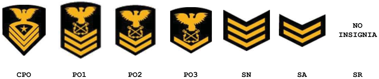
FIGURE 4-2-1 NSCC CADET CHEVRONS AND RATING BADGES